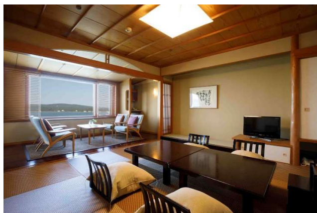
Notoraku – Japanese room with beds