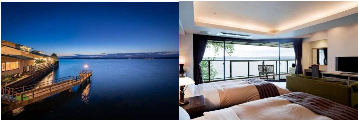
Notoraku – Exterior