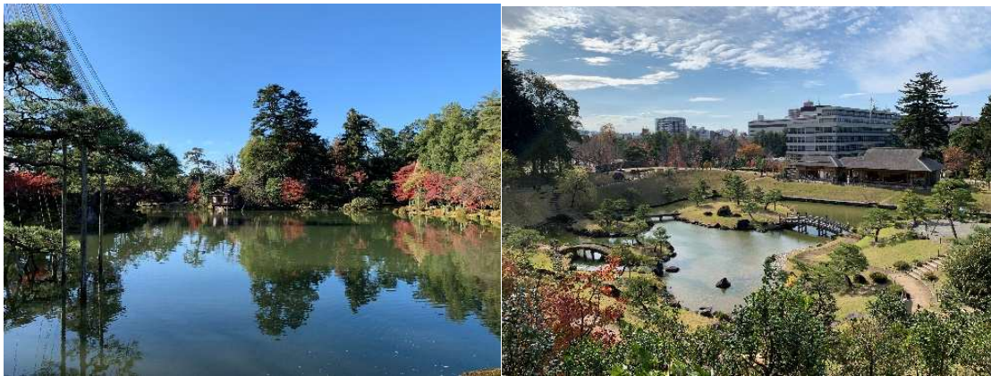
Visit to Higashichayagai area

Breakfast at hotel 09:00 Transfer to Kanazawa by private car 10:30 Arrival in Kanazawa and start of sightseeing of Kanazawa Entrance to Kenrokuen gardens & Kanazawa castle